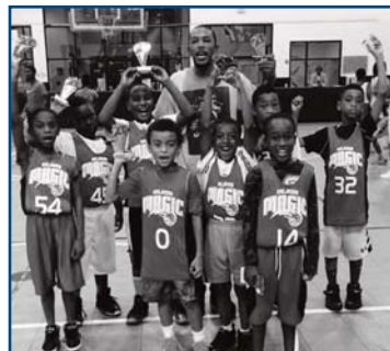
One of The Skills Center Tampa's basketball teams

To learn more about The Skills Center visit their website www.skillscentertampa.org .